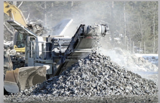
PORTABLE with ANGLE SENSOR

Daily, weekly, monthly, yearly, and resettable job totals, along with calibration and production data logs are stored on the internal USB drive for verification of production at each jobsite.